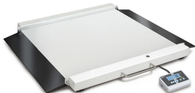
KERN MWA 300K-1M