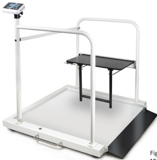
Fig. shows MWA 300K-1M + MWA-A04

Wheelchair scale with integrated ascending ramp and handrail set with folding patient seat – with EC type approval class III and approval for professional, stationary medical use in medical diagnostics