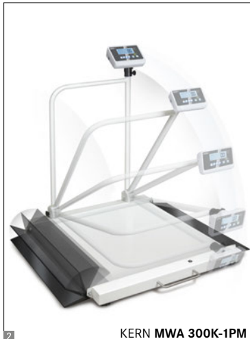
KERN MWA 300K-1PM