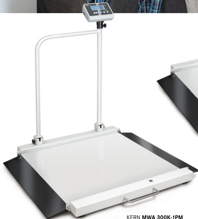
KERN MWA 300K-1PM