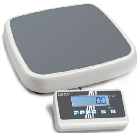
KERN MPC 250K100M