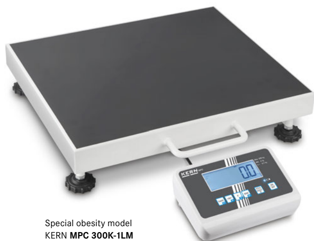
Special obesity model KERN MPC 300K-1LM