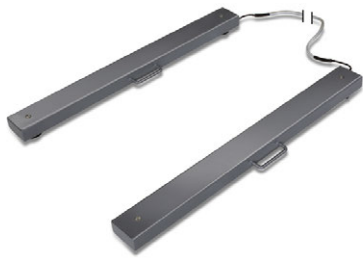
6 KERN KFA-V20