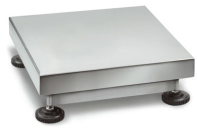
8 KERN KFP-V30