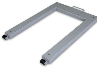
7 KERN KFU-V20/V30