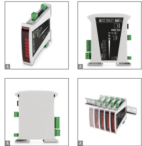
Fig. shows KERN CE HSA