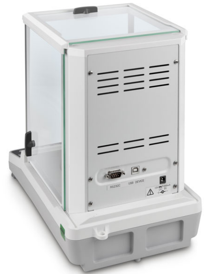
KERN ACS/ACJ with standard data interface RS-232 and USB

The bestseller in analytical balances, with high-quality single-cell weighing system, also with EC type approval [M]